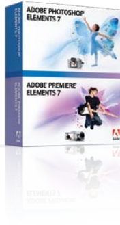
Photo- and video-editing tools™ for digital storytelling US$109.98*